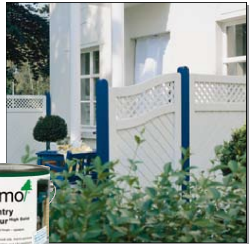
Panels treated with Osmo Country Colour 2101 White and 2506 Royal Blue

Summer house treated with Osmo Country Colour 2308 Nordic Red and 2101 Weiß