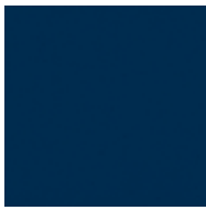
2506 Royal Blue