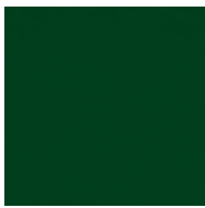
2404 Fir Green