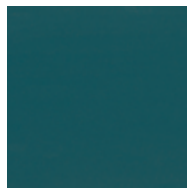
2501 Labrador Blue