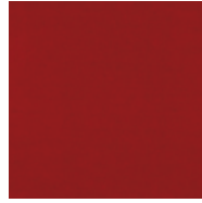
2308 Nordic Red