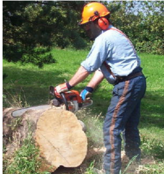
personal protective equipment (PPE): helmet with visor and earmuffs, chainsaw gloves, trousers and boots

You will learn about maintenance on a course, but you need to sharpen the chain regularly. If you