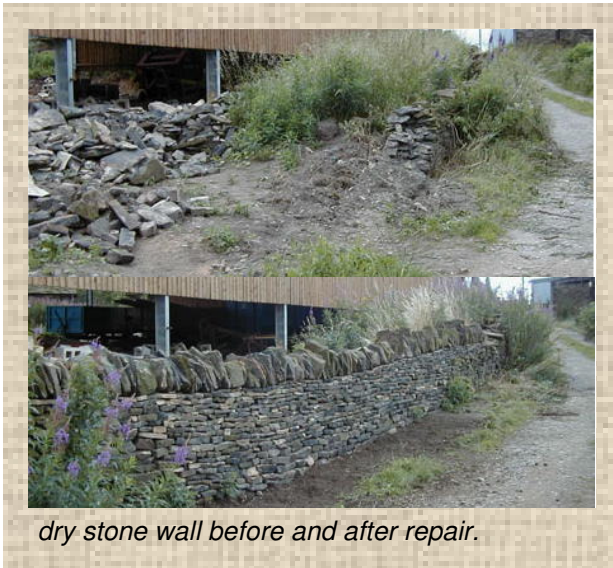
dry stone wall before and after repair.