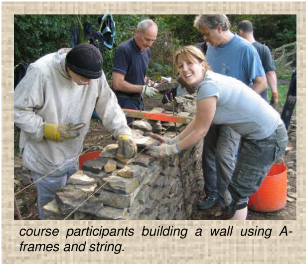
course participants building a wall using A-frames and string.