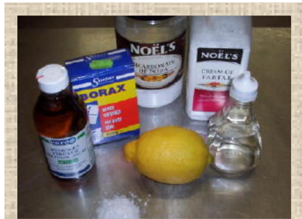
natural cleaners: clockwise from left – hydrogen peroxide (3%); borax; baking soda; cream of tartar; white vinegar; lemon juice; salt

Ecover and Bio-D can provide washing-up liquid in refillable drums, from which you can refill bottles, so that you don't have to keep buying new ones. Making your own is even