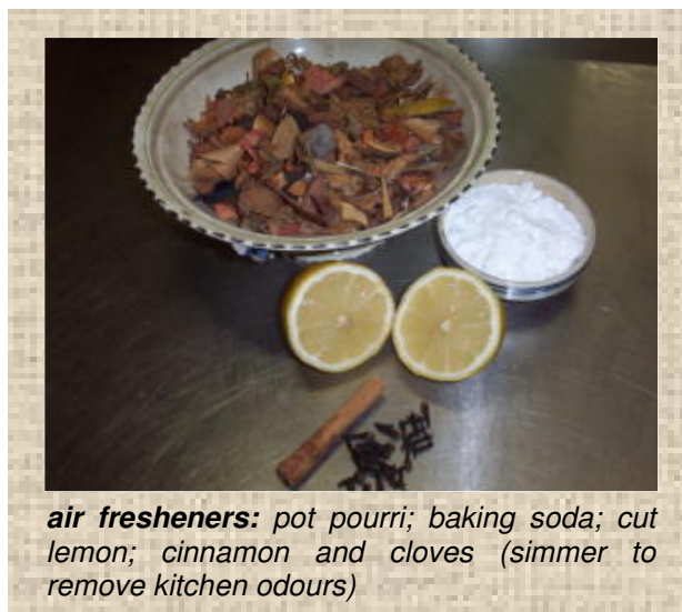
air fresheners: pot pourri; baking soda; cut lemon; cinnamon and cloves (simmer to remove kitchen odours)

rust remover: scour with cream of tartar.