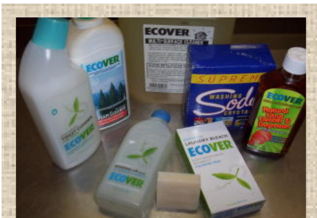
green cleaning products: clockwise from left – toilet cleaner; cream cleaner; multi-purpose cleaner; washing soda; degreaser; laundry bleach; natural soap; washing-up liquid

perchloroethylene : (dry cleaning) toxic air pollutant, probable carcinogen, a tiny amount will contaminate groundwater for many years.