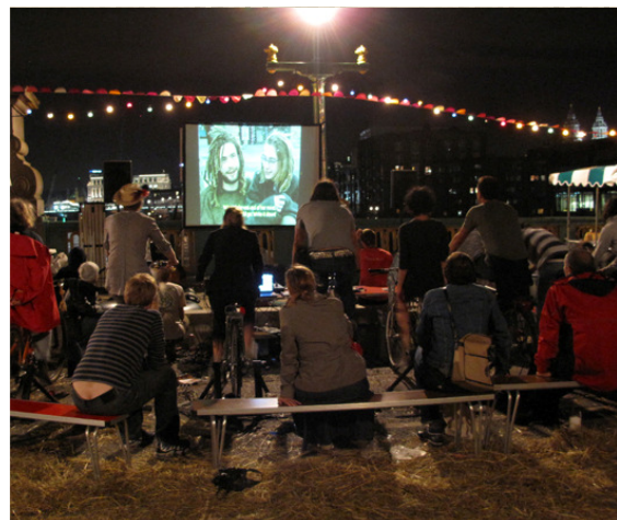
cycle-powered cinema at a festival in London