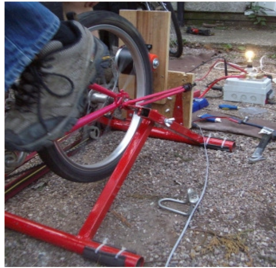
testing a basic, home-made pedal-powered generator by lighting a bulb directly

generator, which contains both the DC and AC kit – then you can just plug anything you like into it and away you go