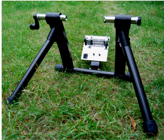
a pedal-powered generator stand onto which you can fix your bicycle to generate electricity; after you've finished, just unfix the bicycle and ride away