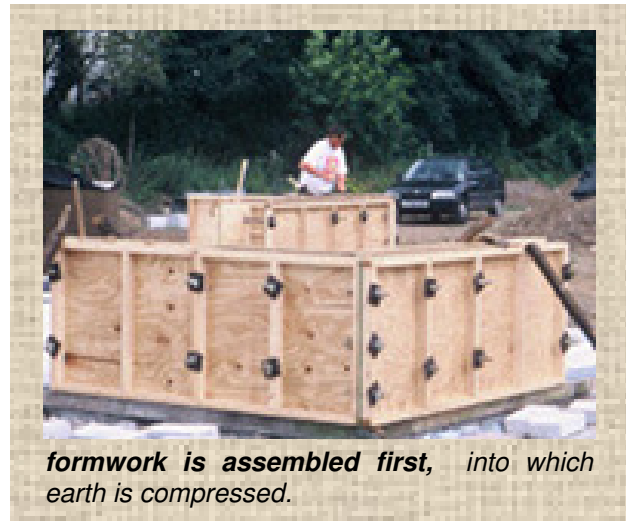
formwork is assembled first, into which earth is compressed.

Foundations can be concrete, but a more eco-friendly alternative could be lime and flint (or rubble). For extra strength, you can have steel rods from the foundations, up through the walls, and secured to the roof timbers. Ply formwork (sections around 600mm high) is fixed onto the foundations about 350mm wide, with wooden spacers keeping the sides apart, and through-bolts holding them together. A pneumatic (or traditionally, manual) ram is used to compress the earth to around 50% of its original height. Spacers come out as you go, (but it's not the end of the world if some are left in). Plastic pipes can be located in the walls as you are ramming, through which electrical wires can be threaded later. The second layer of formwork fits on top of the first, and later the first layer can 'leap frog' on top of the second. Formwork can come off immediately – there's no setting time – and the holes left by the through bolts are filled. Gaps for doors and windows can be cut into the earth, or formwork can be built around them to save ramming work; no lintels are required. Wire brush the walls when the formwork comes off and you have beautiful, natural walls which connect you and your home to the surrounding environment. Add a conventional roof, with a good overhang for added protection from rain. Walls can be sealed, rendered or limewashed like conventional masonry.