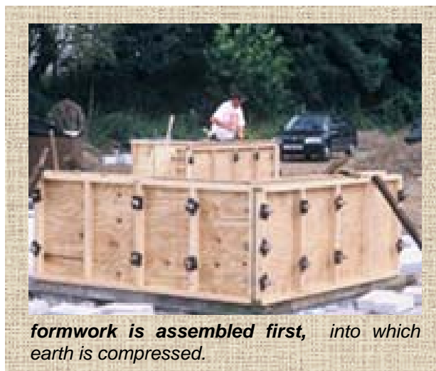
formwork is assembled first, into which earth is compressed.

Foundations can be concrete, but a more eco-friendly alternative could be lime and flint (or rubble). For extra strength, you can have steel rods from the foundations, up through the walls, and secured to the roof timbers. Ply formwork (sections around 600mm high) is fixed onto the foundations about 350mm wide, with wooden spacers keeping the sides apart, and through-bolts holding them together. A pneumatic (or traditionally, manual) ram is used to compress the earth to around 50% of its original height. Spacers come out as you go, (but it's not the end of the world if some are left in). Plastic pipes can be located in the walls as you are ramming, through which electrical wires can be threaded later. The second layer of formwork fits on top of the first, and later the first layer can 'leap frog' on top of the second. Formwork can come off immediately – there's no setting time – and the holes left by the through bolts are filled. Gaps for doors and windows can be cut into the earth, or formwork can be built around them to save ramming work; no lintels are required. Wire brush the walls when the formwork comes off and you have beautiful, natural walls which connect you and your home to the surrounding environment. Add a conventional roof, with a good overhang for added protection from rain. Walls can be sealed, rendered or limewashed like conventional masonry.