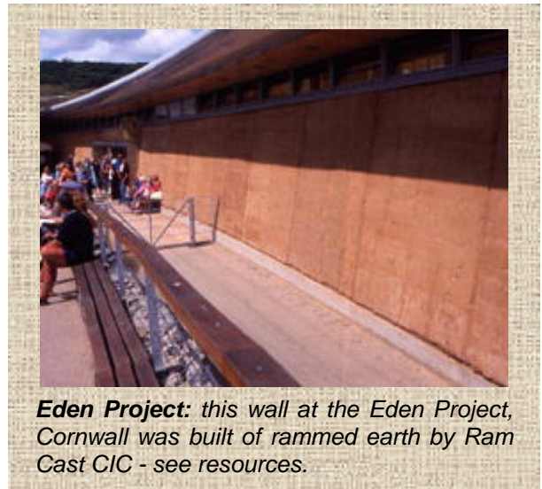
Eden Project: this wall at the Eden Project, Cornwall was built of rammed earth by Ram Cast CIC - see resources.

Rammed earth buildings have low material costs but high labour costs, so are comparable in price with conventional buildings; they come into their own when you consider the health, environmental, thermal and aesthetic benefits.