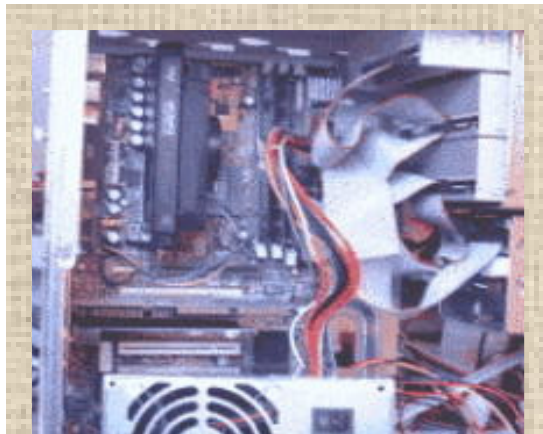
although sometimes daunting, working with computers is not rocket science - you just have to know where to stick the plugs