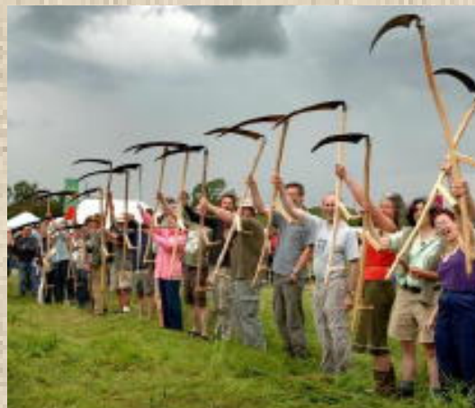
a danger of scything – it can take over your life, and get competitive (in a friendly sort of way!): participants at the fourth West Country Scythe Festival and Competition, 2008 (see resources)

Contact us or visit our website to find out more about our message, networks, factsheets, books, courses, products, services, magazines, links, forum, events and volunteering on organic farms. You can also become a Friend of LILI, receive our e-newsletter, and help us change the world.