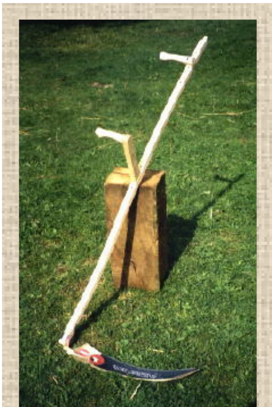
an adjustable wooden snath, with a 60cm Austrian-style blade

There are many styles and traditions of scythe, from heavy wooden English or American style snaths (handles) to lightweight aluminium shafts. Some are available at agricultural merchants. All will do the job, but we recommend Austrian scythes. They are easier to handle and maintain and no more expensive and than traditional English scythes; they are robust, and the blade quality is renowned. In fact some blades are still hand-forged in a factory with 500 years of experience, some from English steel. Sadly, none are now produced in the UK, even for 'English' style snaths, despite a long tradition of scythe blade manufacture, particularly in Sheffield.