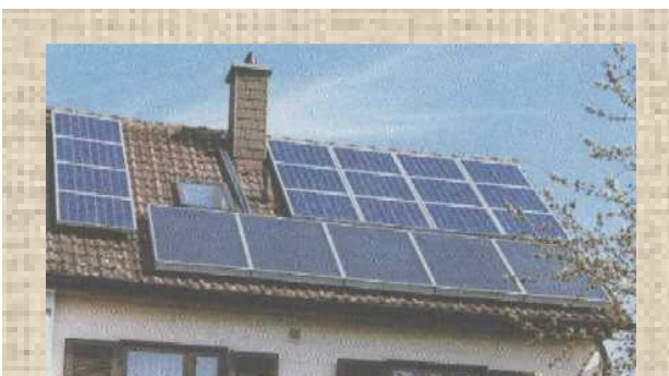
roof in Germany with 16 80-watt photovoltaic panels, which will generate around 1000kWhours of electricity per year – about one third of a family's needs. There are also 5 solar hot water panels at the bottom of the roof, which do not produce electricity – water passes through them and is heated directly.

Pvs take around 3 years to generate the same amount of electricity as is used in their manufacture. Large-scale use of lead-acid batteries would cause environmental problems in their manufacture and disposal, so connection to the grid would be better unless in a remote location. No problems from power cuts though.