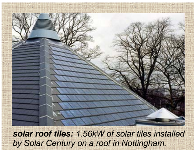
solar roof tiles: 1.56kW of solar tiles installed by Solar Century on a roof in Nottingham.