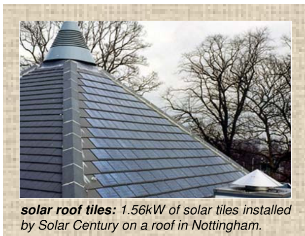
solar roof tiles: 1.56kW of solar tiles installed by Solar Century on a roof in Nottingham.