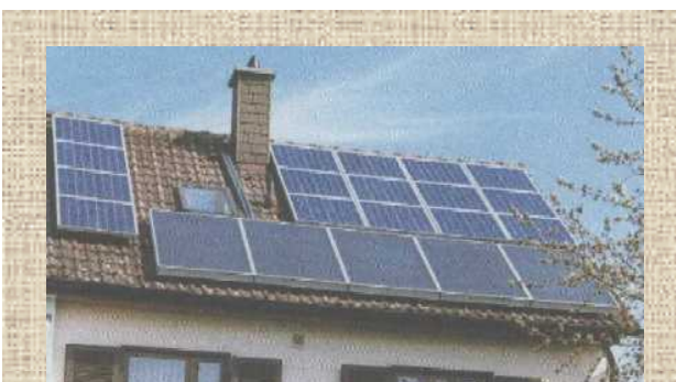
roof in Germany with 16 80-watt photovoltaic panels, which will generate around 1000kWhours of electricity per year – about one third of a family's needs. There are also 5 solar hot water panels at the bottom of the roof, which do not produce electricity – water passes through them and is heated directly.

Large-scale use of lead-acid batteries would cause environmental problems in their manufacture and disposal, so connection to the grid would be better unless in a remote location.