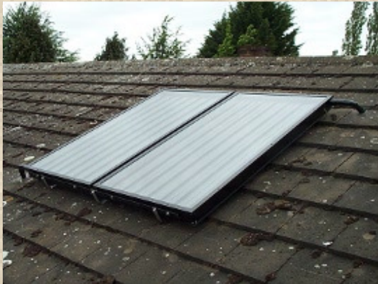
two flat-plate panels installed on a private house in Buckinghamshire. The panels are approximately 1.4 square metres each, making them easy to transport, and to lift onto the roof.