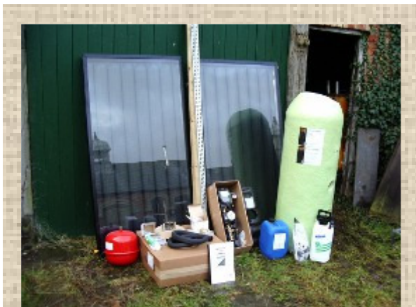
entire system including twin-coil cylinder, expansion vessel and pump & control set

The first thing to do is to choose either evacuated tubes or flat-plate collectors. Installed prices for both are typically in the range £2500 to £5000. If you choose flat-plate, make sure that the collectors have a selective surface – a special coating that maximizes the absorption of solar radiation