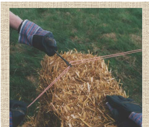
baling needle: this home-made tool allows you to cut and re-bind bales to any size necessary to fit a gap or a corner.