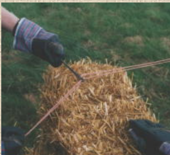
baling needle: this home-made tool allows you to cut and re-bind bales to any size necessary to fit a gap or a corner.