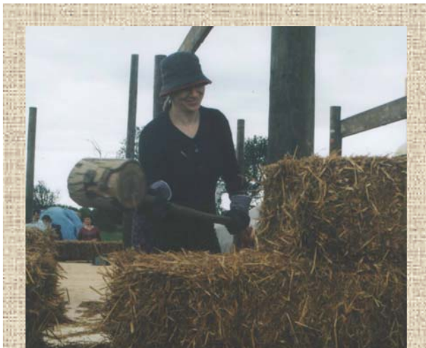
the 'persuader': another home-made tool, this time for gently persuading bales into the position you want.