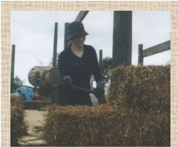
the 'persuader': another home-made tool, this time for gently persuading bales into the position you want.