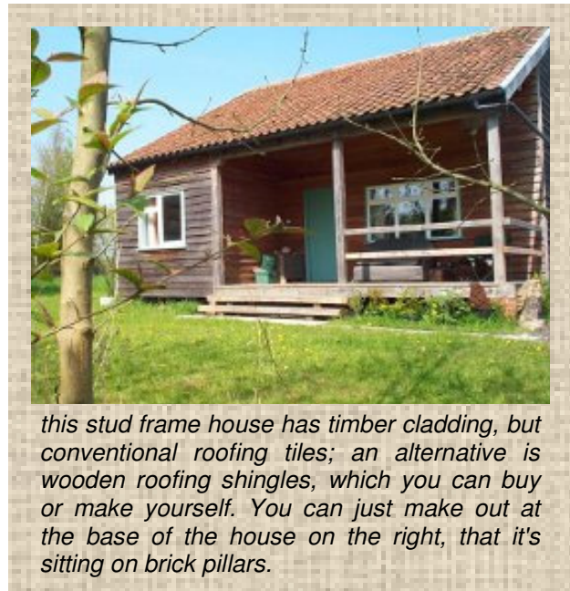
this stud frame house has timber cladding, but conventional roofing tiles; an alternative is wooden roofing shingles, which you can buy or make yourself. You can just make out at the base of the house on the right, that it's sitting on brick pillars.

Timber can be used for a new build or an extension; and you can even use wooden shingles as your roofing material.