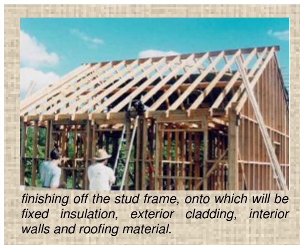
finishing off the stud frame, onto which will be fixed insulation, exterior cladding, interior walls and roofing material.

Traditional timber frame builders tend to use