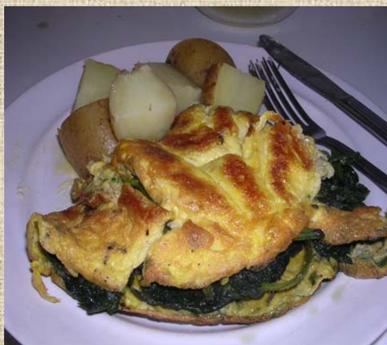
nettle omelette: many wild foods can be cooked in the same way as the cultivated vegetables that we are used to eating. There are many recipes for wild foods in the books in the 'resources' section.

As long as we are sensitive when collecting wild food and consider other species, harvesting wild food can be beneficial to the environment. Wild food has no packaging, no chemicals to force it to grow, and can be picked local to your area, minimising food miles and pollution from vehicle exhausts. Picking wild food in moderation can foster appreciation of nature, resulting in greater conservation of species. Eating a range of different species maintains biodiversity - the opposite of our intensive farming system, where we grow crops in monocultures, with damaging effects for the environment. Target species are favoured over wild species, and are grown intensively using pesticides, which can have detrimental effects on wildlife. Many of the wild animals that can be eaten are pests that have to be controlled and are often wasted. One example is the grey squirrel, a tasty introduced species that causes damage to tree saplings in woodlands, and outcompetes our native red squirrel. If they are to be culled, isn't it better to eat them in preference to animals that may have been fed intensively-grown crops, housed indoors, pumped with antibiotics and transported many miles to reach your plate? Consuming wild food can instill a greater respect for the environment, reconnecting us to the origins of our food, and illustrating our dependency on nature for