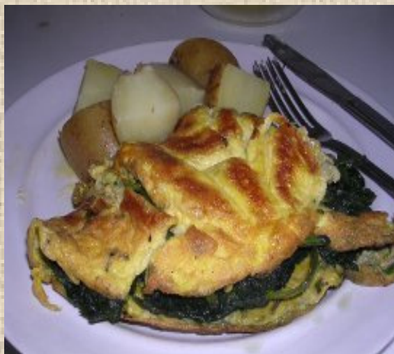
nettle omelette: many wild foods can be cooked in the same way as the cultivated vegetables that we are used to eating. There are many recipes for wild foods in the books in the 'resources' section.

The subject also includes fishing and harvesting seafood, but this is a topic for a separate factsheet.