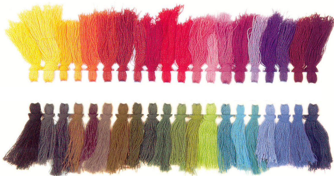
Some of the colours available through direct dyeing

Azo dyes are a type of direct dye that are made from a nitrogen compound. They are usually red, brown, or yellow, and make up about half of the dyes produced. They are known to give off a range of carcinogenic particles and have hence been banned by several EU countries.