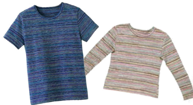
Muji recycled yarn t-shirts