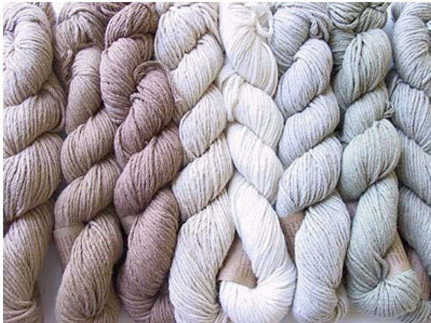
Naturally colored cotton

The only naturally coloured cotton with a fibre length long enough to mill was developed by Sally Fox and is called FoxFiber. It's available in shades of green, beige, brown and blue and is sold by Vreseis Ltd. It's grown organically but we don't yet know whether it is irrigated sustainably. Naturally brown cotton is grown in Peru, Ecuador, Central America, Mexico and Southeastern USA, so it could have some social benefits, but not as many as it would if it was grown elsewhere, such as West Africa. We're not yet sure how viable it would be to begin growing a FoxFiber crop in West Africa: more investigation along these lines will be needed should we decide to pursue this route.