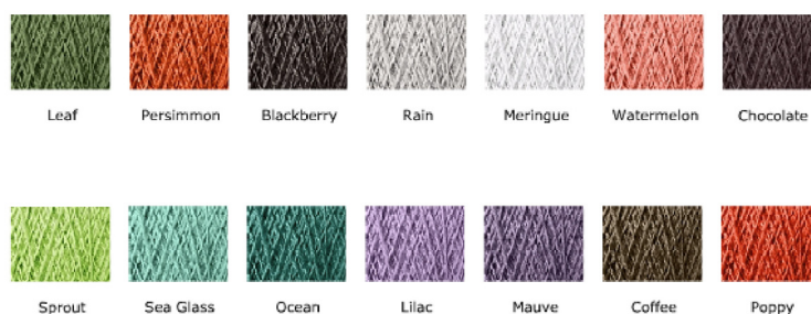
The colours available using Looolo's closed loop dye system

If this project were entitled 'the perfect jumper', this closed loop method of dyeing would be perfect. Developed by Climatex according to the principles of super eco-gurus McDonough and Braungart (they of the pioneering 'Cradle to Cradle' approach), the system's already in operation, forming an important part of Looolo's biodegradable textile story. Remainders from the dye baths are purified, recycled and reused entirely, so pollutants are never released into the outside world. And as well as being super-eco, the colours produced are super-cheerful too. But for us, the drawback is that these methods can only be used to dye organic wool, ramie (a member of the linen family) and viscose. Cotton, linen and cellulose have different characteristics which mean we cannot use this method for our t-shirt. An organic merino wool t-shirt could be dyed using this method, but as we feel our first perfect t-shirt will be made from vegetable fibre, partly because there are ethical issues involved in the production of merino wool, we can't currently pursue this method.