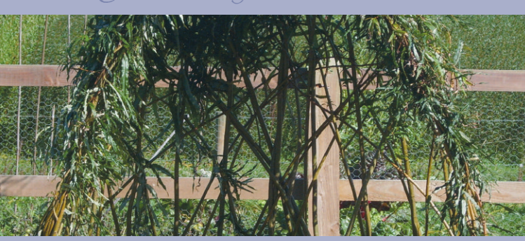
to continue a traditional rural business.