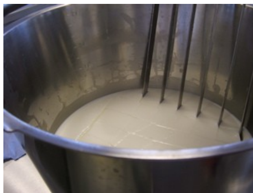
Cutting the curd in a stainless steel bucket to release the whey.

Feel free to upload, print and distribute this sheet as you see fit. 220+ topics on our website, each with introduction, books, courses, products, services, magazines, links, advice, articles, videos and tutorials. Let's build a sustainable, non-corporate system.