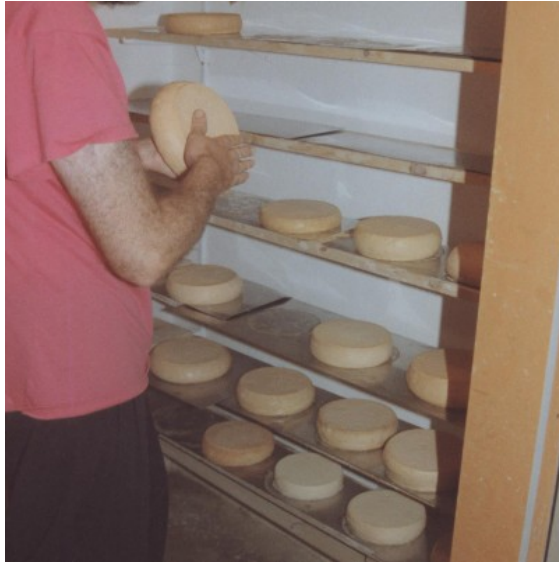
Turning farmhouse hard cheeses as they mature on the rind.