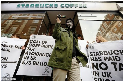
Independent businesses have to pay their fair share of taxes; why not corporations? There have been many protests outside corporate branches asking this question.