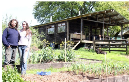
The first couple to build a home under the Welsh One-Planet Development policy, which allows people to build homes on their land if they commit to live with a one-planet footprint or less.

A number of communities have taken up the One Planet challenge and are working towards keeping consumption within one-planet limits. Wales is aiming to achieve it within a generation, and the One Planet Council offers people an affordable and sustainable way to live on their own land.