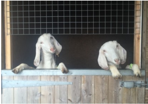
Anglo Nubians: a popular dairy breed.