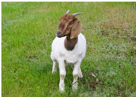
The Boer goat is the breed most commonly raised for meat production.

Vitamins and minerals are essential for goat health and all goats should have access to a mineral lick. Please note that some goat mineral licks can be toxic to sheep.