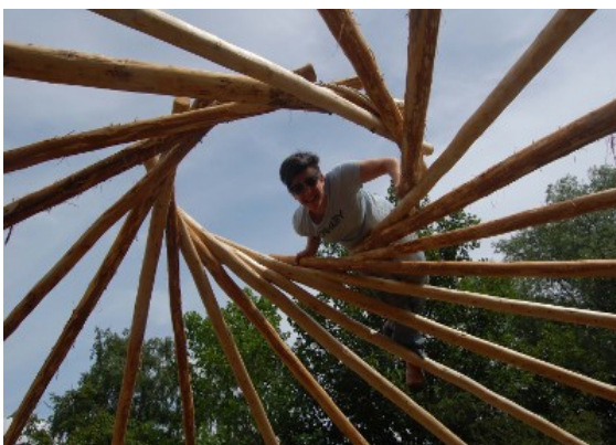
Reciprocal frame roof from inside a roundhouse under construction.

Attend a course and read books (see resources) to learn how to do it yourself, or hire a specialist to build one for you. You can choose from various walling materials (see above), and they can potentially be more than one storey. Here are some tips for foundations and roofs.