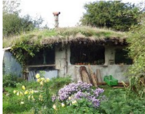
Tony Wrench's famous 'that roundhouse' in Pembrokeshire – see thatroundhouse.info .

An interesting roofing option is the reciprocal frame roof. The most popular type has rafters radiating out like the spokes of a wheel - every rafter resting on the previous one, with no central support. The second most common reciprocal roof is the 'whirling log' variety, where there are no rafters, but instead, a set of ring beams radiate inwards from the walls, each one sitting on the previous one and twisted half a turn - i.e. the shape you would get if you sat one 50p on top of another so that the points of one overlay the flat edges of the one below - the coins getting smaller as they get higher. Alternatively, roundhouses can